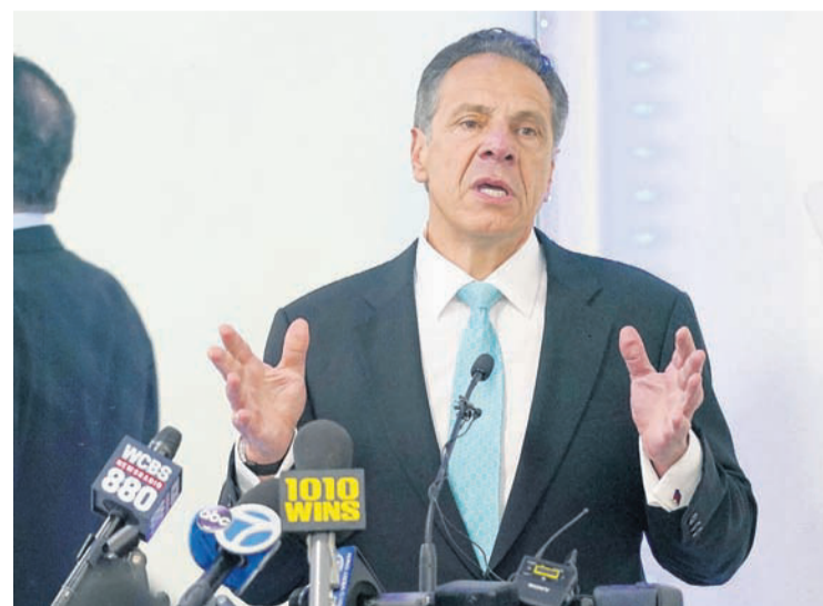
Former New York Gov. Andrew Cuomo speaks during a New York Hispanic Clergy Organization meeting, Thursday, March 17, 2022, in New York.